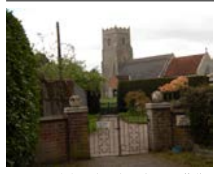
St Botolph's Church in Iken, Suffolk