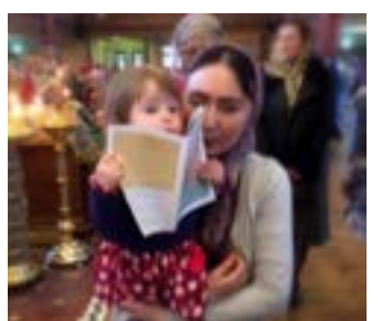
Can't wait to get your hands on the latest Newsletter? Subscribe now!