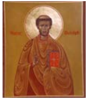
St Botolph of Iken

St Botolph is one of the most venerated saints in Eastern England and one of the greatest English missionaries in the seventh century. This wonderful saint has for many centuries been venerated throughout England. Over 70 ancient churches and several wells in England are dedicated to St Botolph and pilgrimages are arranged to these places.