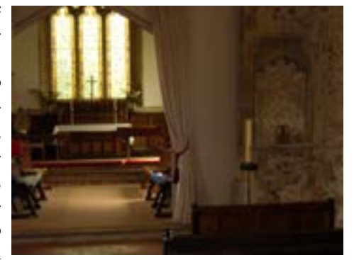
St Botolph's Church in Iken, Suffolk

relics were lost or hidden during the Reformation, Botolph is greatly venerated by English Christians to this day. Dozens of churches are dedicated to him in most regions of England (Suffolk, Norfolk, Cambridgeshire, Essex, Kent, Sussex, Hertfordshire, Buckinghamshire, Oxfordshire, Warwickshire, Northamptonshire, Rutland, Lincolnshire and Yorkshire, in addition to several churches in London) and even Scotland. Over 10 towns and villages are named after St Botolph.