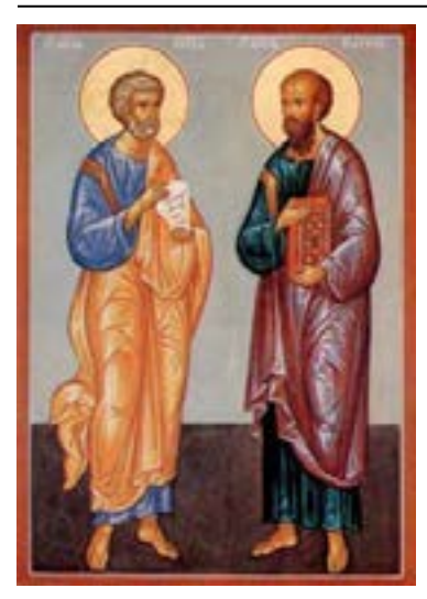
Saints Peter and Paul

is a rhythm. Our modern world has lost most of its natural rhythm. The sun rises and sets but causes little fanfare in a world powered and lit by other sources. In America, virtually everything is always in season, even though the chemicals used to preserve this wonderful cornucopia are probably slowly poisoning our bodies.